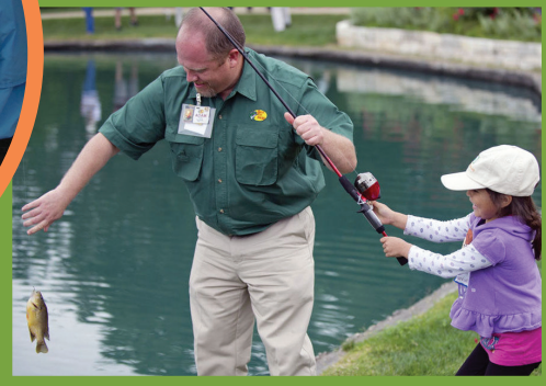
A young girl caught her first fish with the help of a Bass Pro Shops employee.

Fishing camps, boating safety camps, and family fishing workshops helped introduce children and families to casting, fishing, canoeing and environmental education.